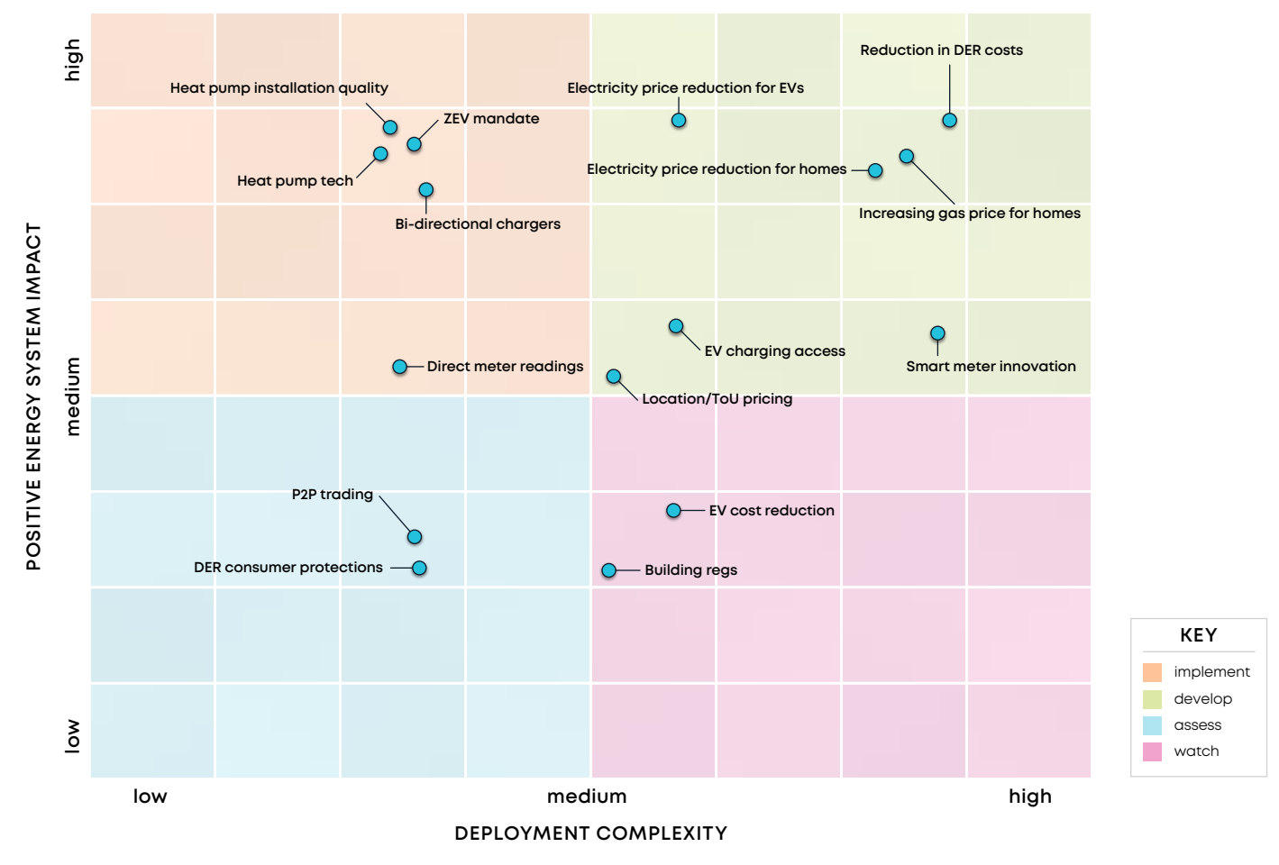
Figure 2: Energy system impact vs deployment complexity matrix of solutions to enable mass energy system participation